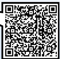
OHS Guideline G3.19