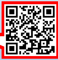
Incident Notification on PolyNet